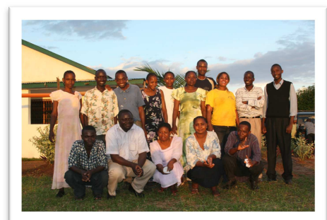
Humanitarian organizations trained by US Synthetic employees in continuous improvement principles